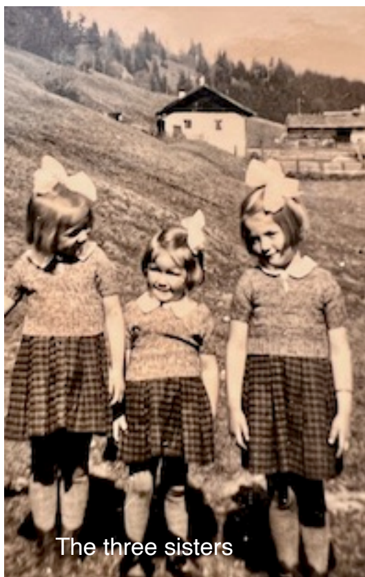
The three sisters